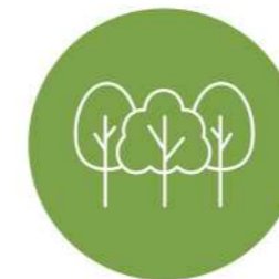
Chelmsford Garden Community – a design exemplar in the National Design Guide

Alongside the existing offer, Chelmsford is a hub of new communities, with various housing projects already completed and others well underway. A new community of around 10,000 new homes is shaping the future growth of Chelmsford within the Chelmsford Garden Community – a development which has already been recognised as a design exemplar in the National Design Guide.