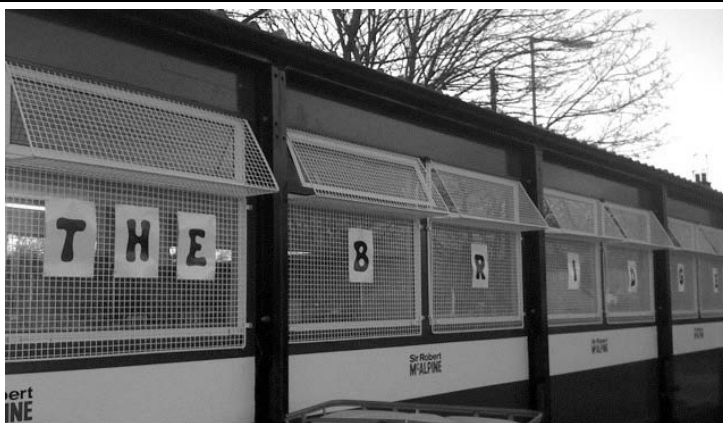
The Bridge Flood Support Centre, Northside of the river

Callers will be asked a number of questions about their current living arrangements, how their properties and lives