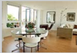
Sovereign Point Apartment Lounge