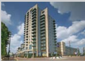
Sovereign Point Apartment Tower