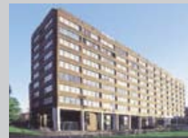
St. James's House Pendleton