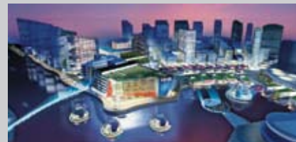
Future Media City:UK Adjacent to The Lowry Outlet Mall