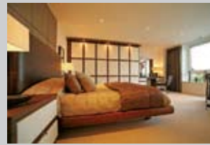
Sovereign Point Apartment Bedroom