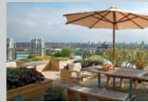
Sovereign Point Penthouse Garden