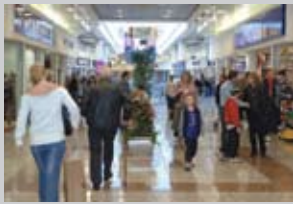
Lowry Outlet Mall Retail Shops