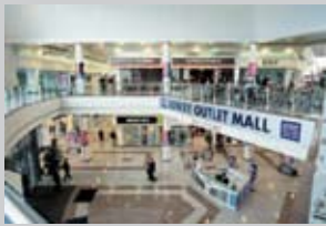
Lowry Outlet Mall Plaza Reception