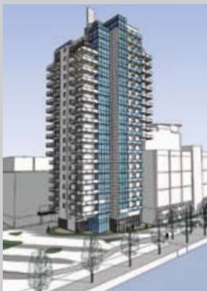
Proposed New Apartment Tower at The Lowry Outlet Mall

The Emerson Group has long enjoyed a successful working relationship with the City of Salford.