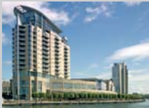
Imperial Point Apartment Tower