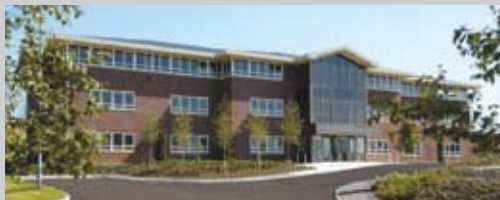
Proposed Broadway House Salford Quays

In summary the Group's long-term involvement in Salford has led to the creation of excellent landlord / tenant relationships, which has resulted in repeat business, with many tenants choosing to expand or transfer to other premises in the Group's portfolio.