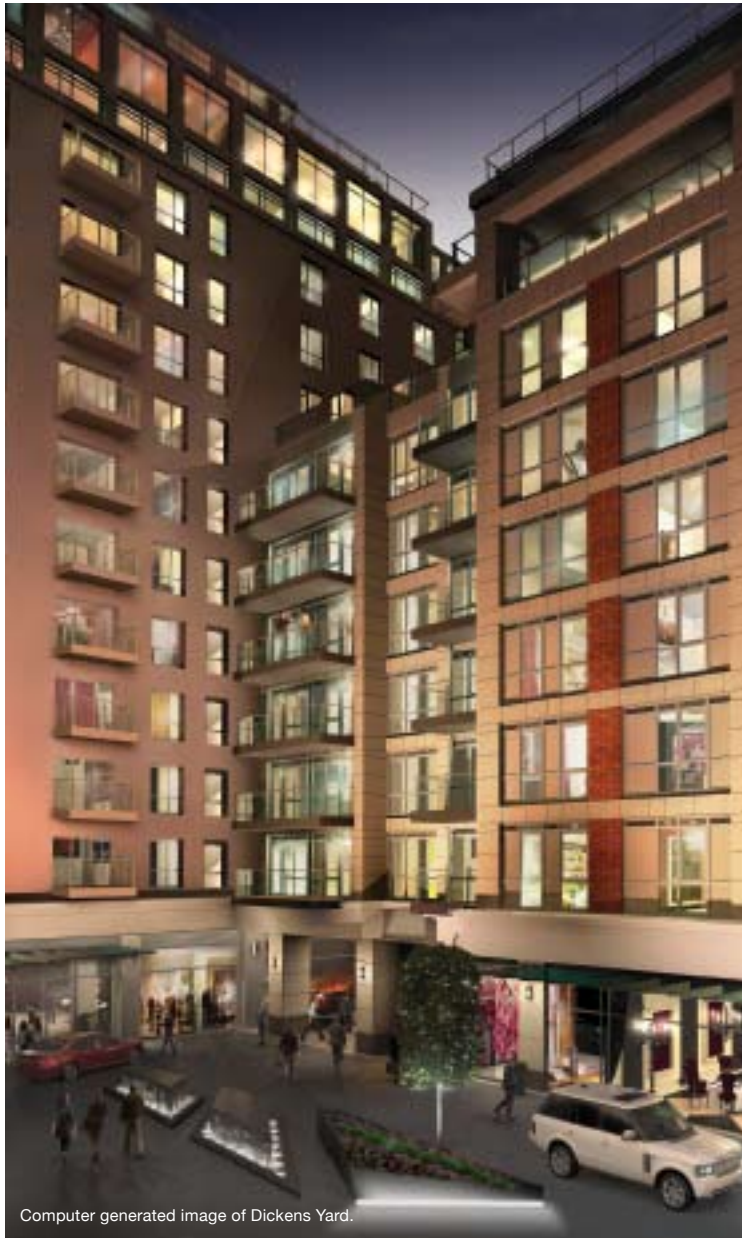
Computer generated image of Dickens Yard.