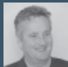
Alan Watt New Homes