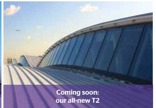
Coming soon: our all-new T2