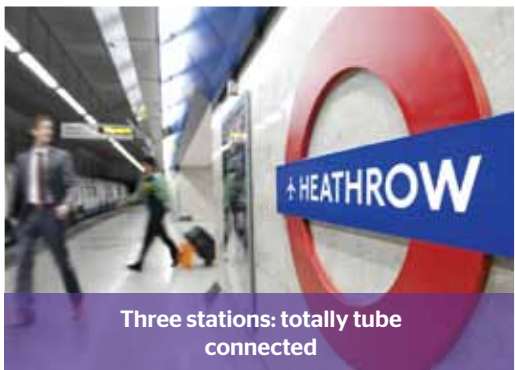
Three stations: totally tube connected