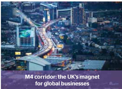
M4 corridor: the UK's magnet for global businesses