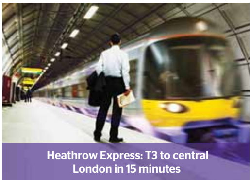
Heathrow Express: T3 to central London in 15 minutes