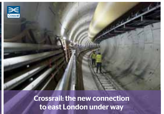
Crossrail: the new connection to east London under way

The UK needs better connections with the world's markets. Only one place is best positioned to provide them. That place is the UK's hub airport: Heathrow. We're already one of Europe's best connected. Already a magnet for global business. Already investing some £11 billion in better transport links; new and better terminals; and a better travel experience (with another £3 billion to come). So ask yourself - who's better placed to bring the world to your door - than the airport that already is?